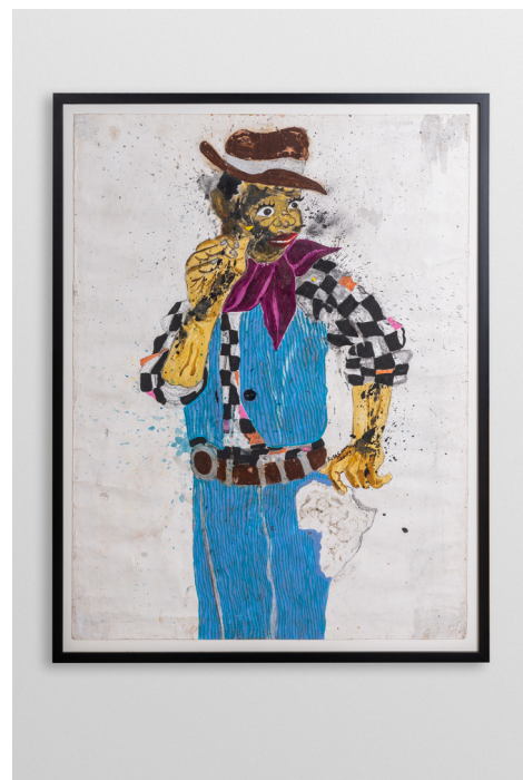
7 KURA SHOMALI L'AFRIQUE DANS MA POCHE, 2020 MIXED MEDIA ON PAPER 100 × 75 CM 6500 CHF