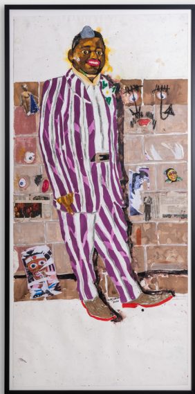
1 KURA SHOMALI MICK JAGGER, 2020 MIXED MEDIA ON PAPER 124 x 75 CM 6500 CHF