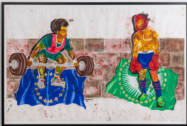
5 KURA SHOMALI COUP DU MARTEAU, 2020 MIXED MEDIA ON PAPER 160 x 100 CM 8500 CHF