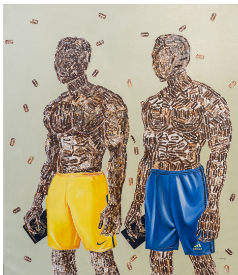
2 JOYCENATH TSHAMALA FILE D'ATTENTE 2, 2021 RUST AND ACRYLIC ON CANVAS 140 × 130 CM 3500 CHF