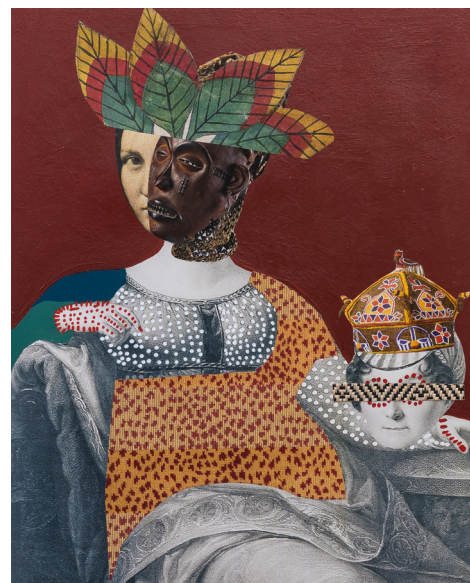
6 MALIZA KIASUWA MASOLO 2, 2021 MIXED MEDIA ON ENGRAVING 35 × 45 CM 900 CHF