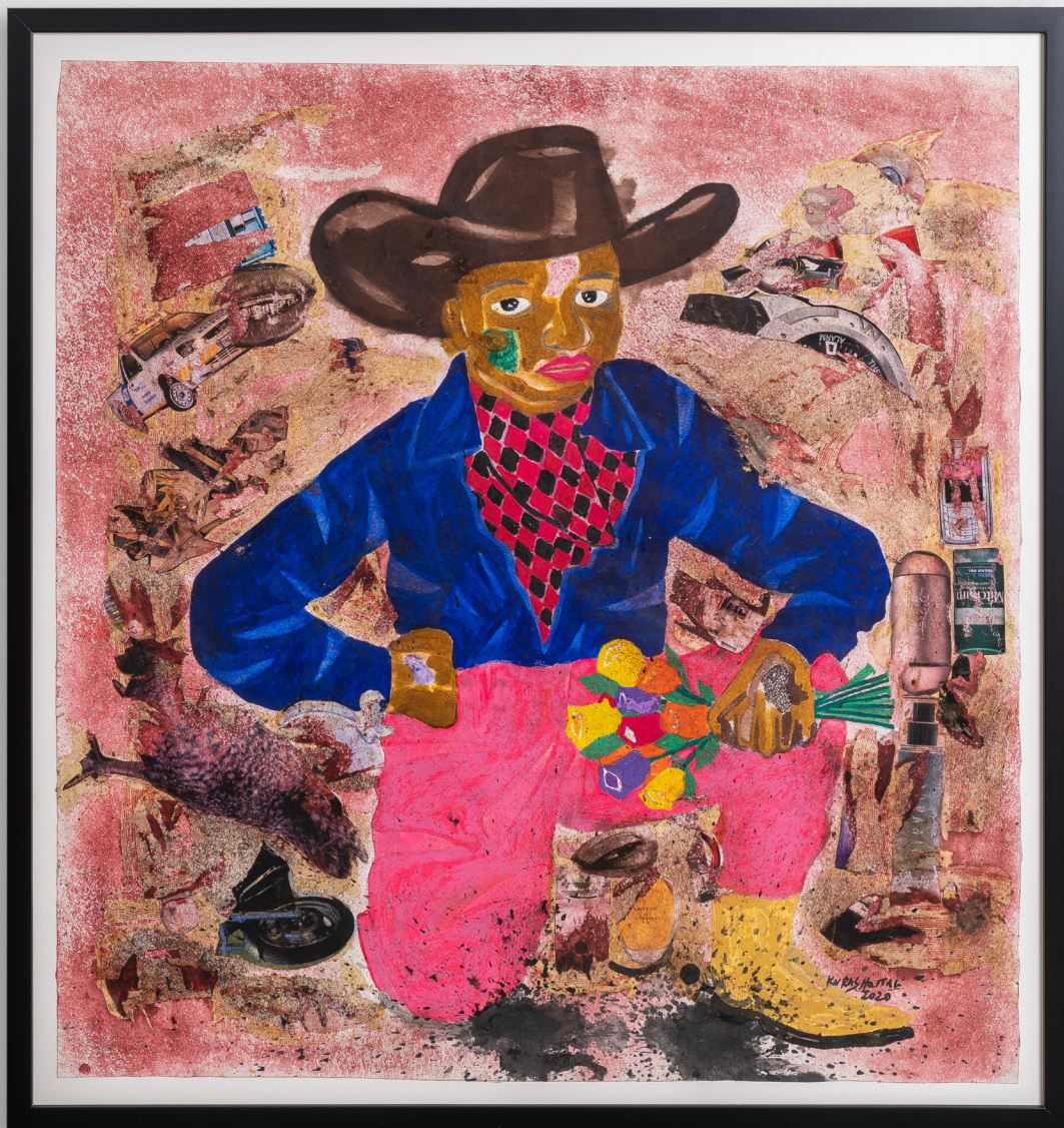
KURA SHOMALI FAR WEST, 2020 MIXED MEDIA ON PAPER 80 × 75 CM