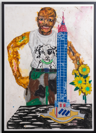
4 KURA SHOMALI HOMMAGE KINGELEZ, 2020 MIXED MEDIA ON PAPER 85 x 55 CM 4000 CHF