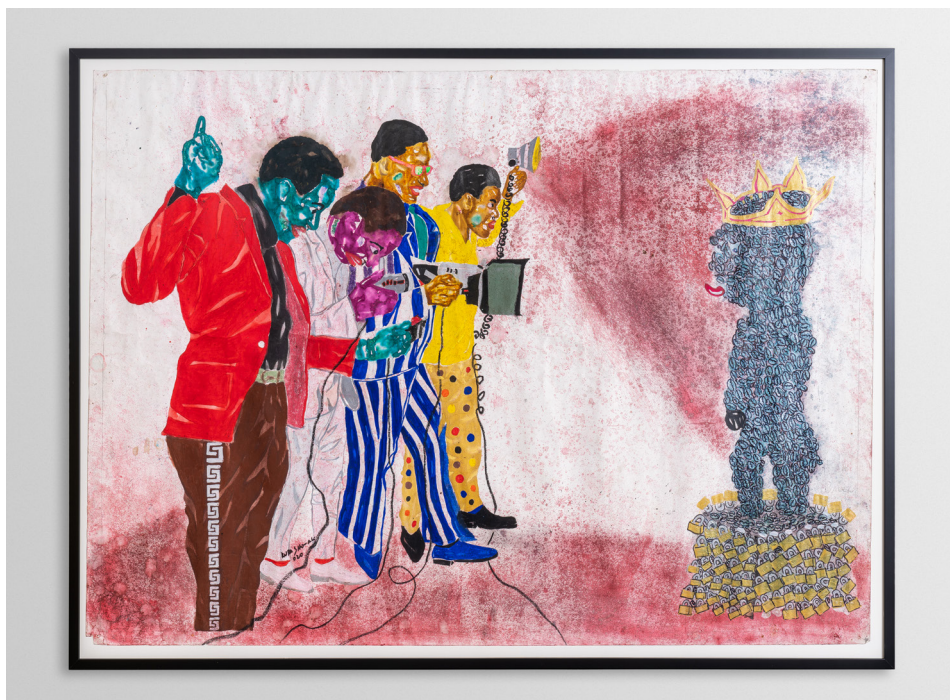
6 KURA SHOMALI LE MYTHE DE LA TRIBU LUBA, 2020 MIXED MEDIA ON PAPER 110 × 180 CM 9500 CHF