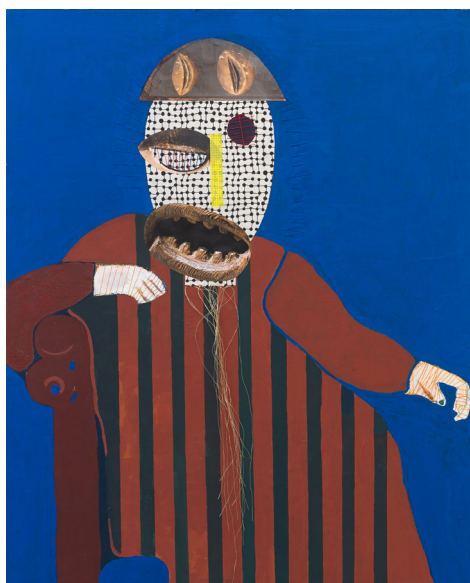
1 MALIZA KIASUWA THIS IS MY PLACE, 2021 MIXED MEDIA ON PAPER (COTTON THREADS AND ACRYLIC) 60 × 80 CM 3500 CHF