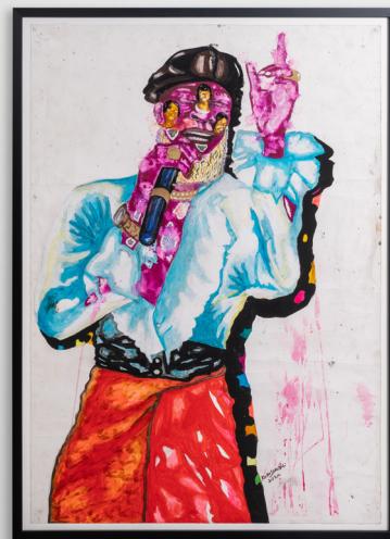
3 KURA SHOMALI MELLENCAMP, 2020 MIXED MEDIA ON PAPER 100 x 70 CM 4500 CHF