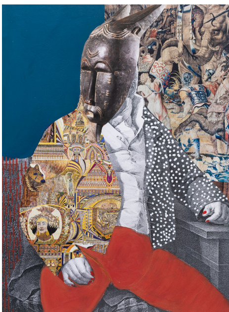
8 MALIZA KIASUWA MASOLO 4, 2021 MIXED MEDIA ON ENGRAVING 35 × 45 CM 900 CHF