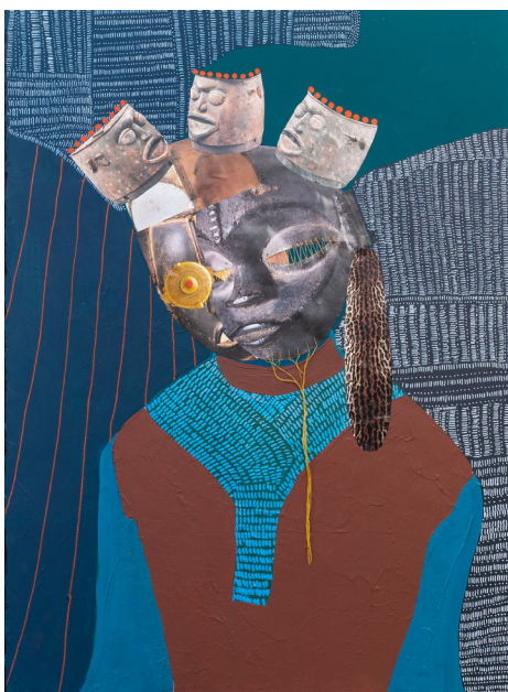
2 MALIZA KIASUWA EMPIRE HYBRIDE, 2021 MIXED MEDIA ON PAPER (COTTON THREADS AND ACRYLIC) 60 × 80 CM 3500 CHF