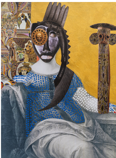
5 MALIZA KIASUWA MASOLO 1, 2021 MIXED MEDIA ON ENGRAVING 35 × 45 CM 900 CHF