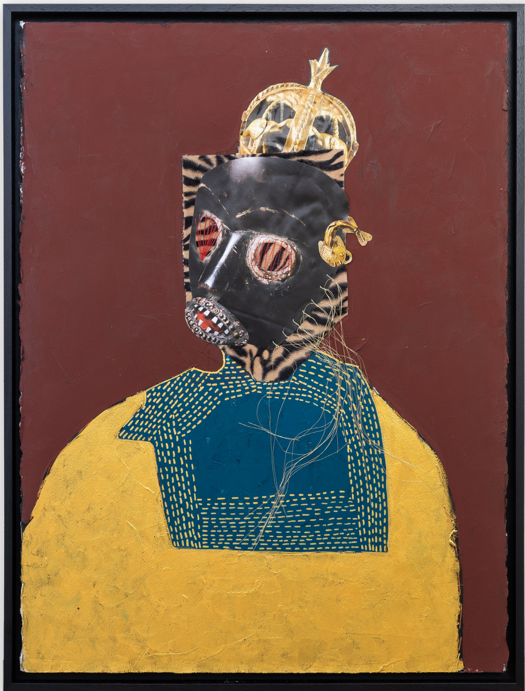
MALIZA KIASUWA EMPIRE HYBRIDE, 2021 MIXED MEDIA ON PAPER (COTTON THREADS AND ACRYLIC) 60 × 80 CM