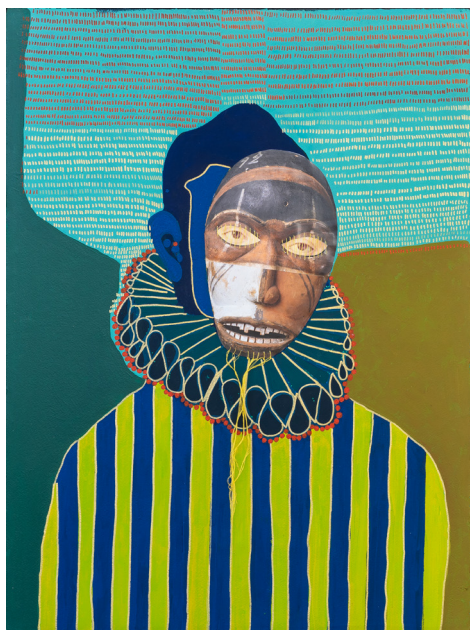
4 MALIZA KIASUWA DUALITÉ, 2021 MIXED MEDIA ON PAPER (COTTON THREADS AND ACRYLIC) 60 × 80 CM 3500 CHF