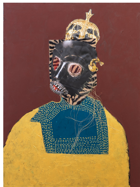
3 MALIZA KIASUWA LES COURONNES ANCESTRALES, 2021 MIXED MEDIA ON PAPER (COTTON THREADS AND ACRYLIC) 60 × 80 CM 3500 CHF