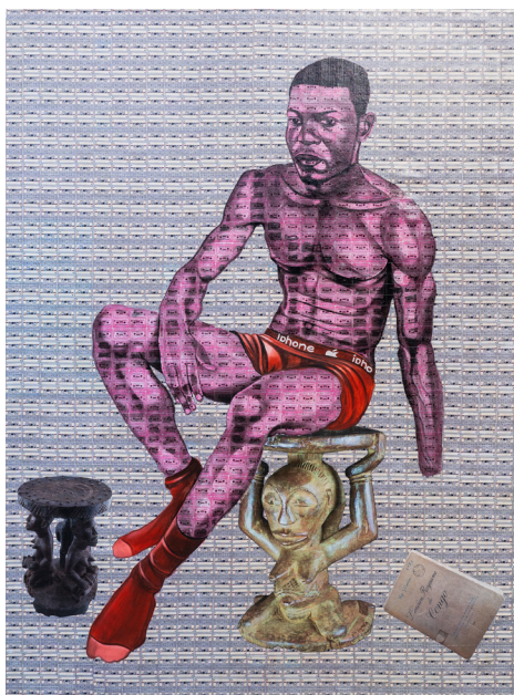
3 JOYCENATH TSHAMALA MODÈLE 1, 2021 MIXED MEDIA ON CANVAS (MAROUFLAGE AND ACRYLIC) 160 × 120 CM 4500 CHF