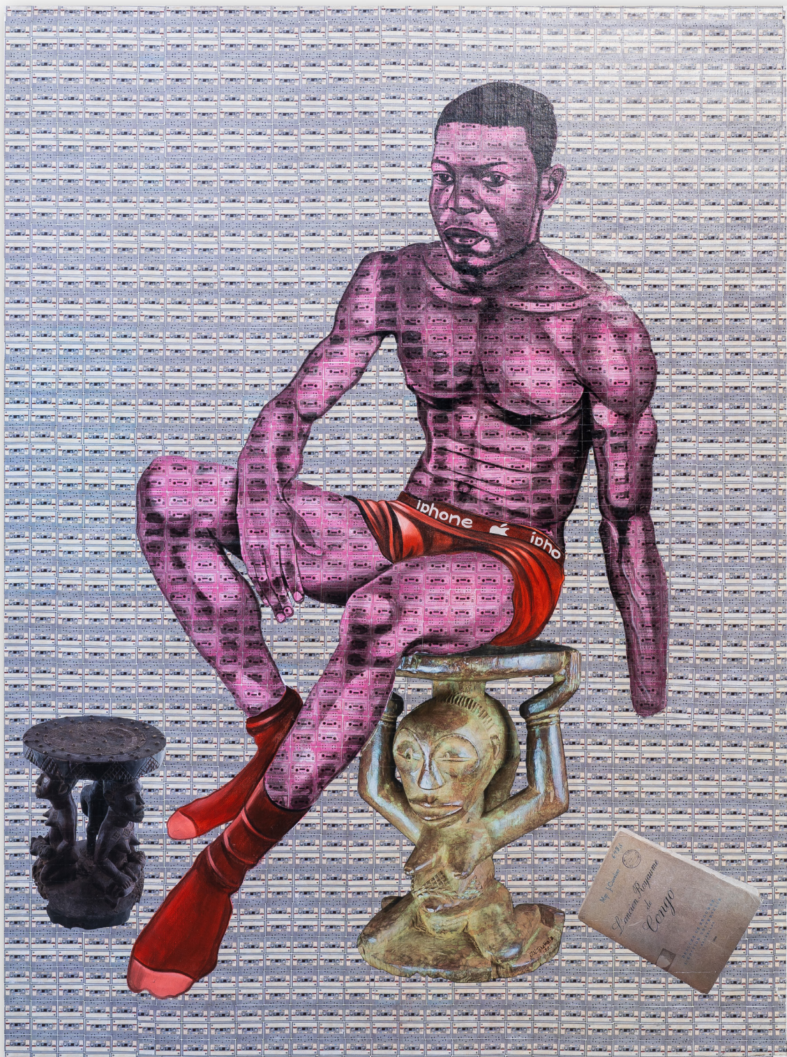
JOYCENATH TSHAMALA MODÈLE 1, 2021 MIXED MEDIA ON CANVAS (MAROUFLAGE AND ACRYLIC) 160 × 120 CM