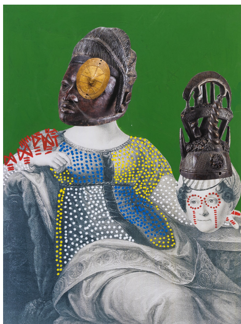
7 MALIZA KIASUWA MASOLO 3, 2021 MIXED MEDIA ON ENGRAVING 35 × 45 CM 900 CHF