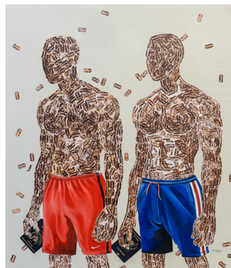
1 JOYCNATH TSHAMALA FILE D'ATTENTE 1, 2021 RUST AND ACRYLIC ON CANVAS 140 × 130 CM 3500 CHF